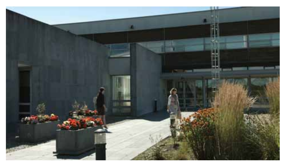
The Environmental Protection Agency www.epa.ie